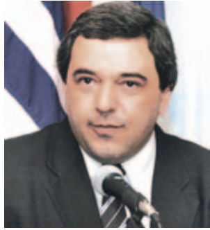
Mario Bergara, President of the Central Bank of Uruguay

Following the 2002 crisis, the challenge was to make institutional reforms and rework the legislation on competition,