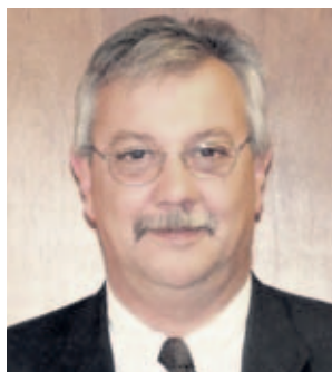
Enrique Pintado, Minister of Infrastructure and Public Works

omy's growth, the government is counting on investments in innovation-based sectors (ie pharmaceuticals, software), as well as in telecommunications and transportation infrastructures, renewable energies, the electricity sector, and the naval industry for greater development. According to Mr. Kreimerman, these are the fields for which Uruguay has highly-trained human capital and a very favorable investment regime, and not to men-