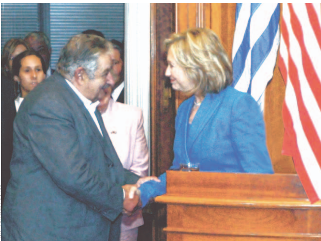
Secretary of State Clinton attended Uruguayan President Jose Mujica's inauguration ceremony on March 1, 2010 in which she praised his country's commitment to democracy

Mr. Mujica is carrying on with most of his predecessor's policies, among the most noteworthy perhaps is Plan Ceibal, or the One Laptop per Child program. Uruguay is the first country in the world to have full connectivity at the primary school level, and the second phase, supplying students and teachers at the secondary level, will reach completion this year.