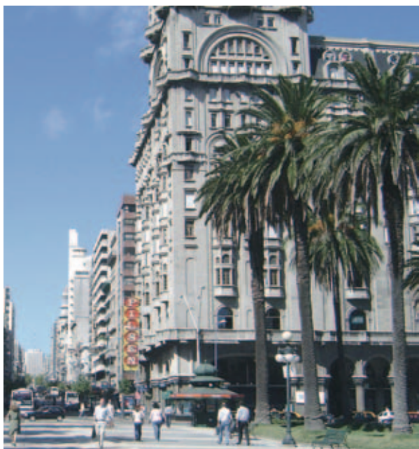
Uruguay's banking sector still has the capacity to welcome new banks

Three-time winner of Euromoney's 'Best Bank in Uruguay' (2007-2009), NBC is a universal bank involved in all sectors and boasts the largest retail banking network of any Uruguayan bank. It maintains close relationships with its clients, and places a strong emphasis on family banking and solutions for SMEs.