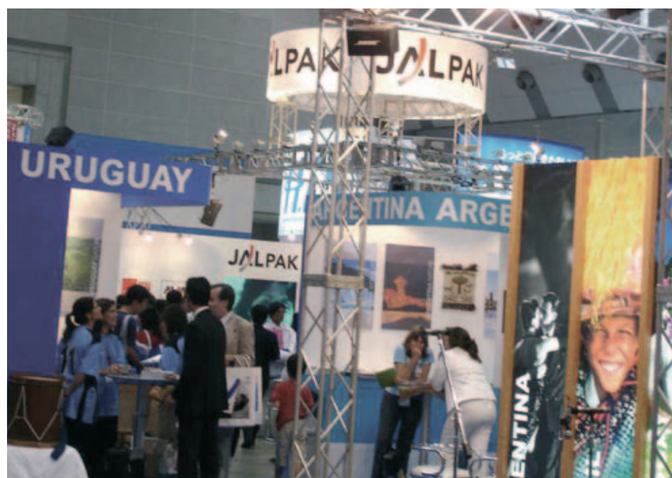
Montevideo, Uruguay was chosen as headquarters of Mercosur, the common market of the south created in 1991

We're highly aware of the requirements demanded by Plan Ceibal and we've got a large team here at ANTEL working on meeting them.