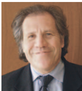
Luis Almagro, Minister of Foreign Affairs

Definitely, and this is something that has been analyzed