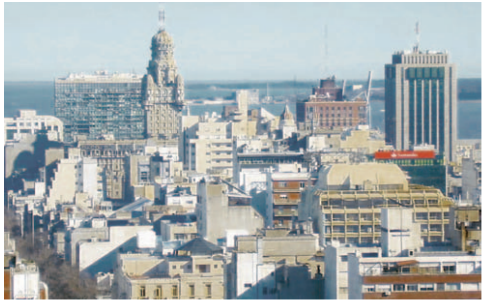
The Central Bank of Uruguay has laid the groundwork for solid economic growth