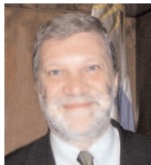
Roberto Kreimerman, Minister of Industry, Energy, and Mines

Although the traditional sectors (meat, dairy, and rice, for example) still drive the econ-